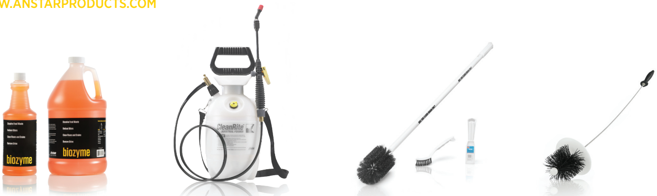
| #100610 QT / #100615 GAL

WATCH OUR TRAINING VIDEO ON HOW TO APPLY BIOZYME AT WWW.ANSTARPRODUCTS.COM